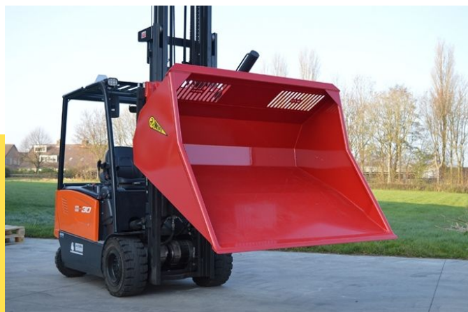
WIFO aardappelschapbak op vorkenbord