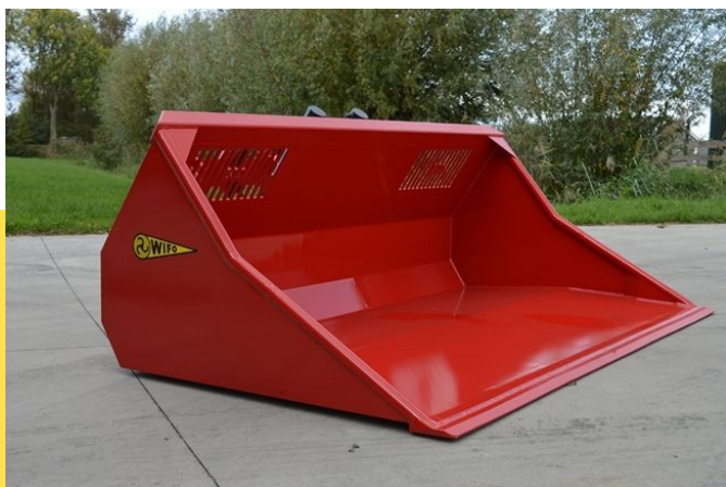
WIFO Aardappelschepbak heavy duty op vorkenbord