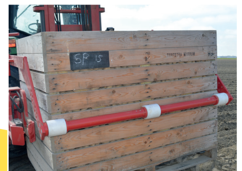
Forward tipping angle of 180°